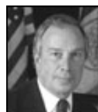
George E. Pataki Governor

"...It is always gratifying to recognize individuals and organizations that are committed to strengthening their communities and to making a difference in the lives of others."